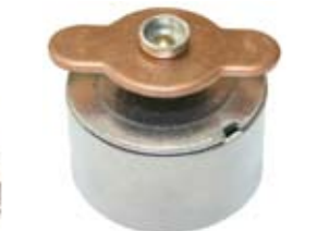
ARCO SW058HD COIL & CONTACT ASSEMBLY