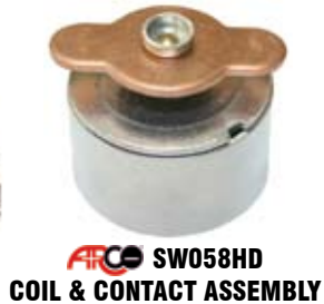
ARC SW058HD COIL & CONTACT ASSEMBLY