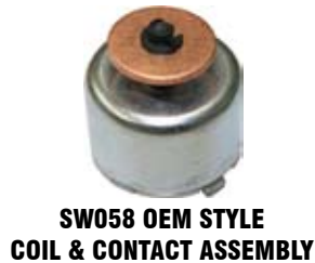
SW058 OEM STYLE COIL & CONTACT ASSEMBLY